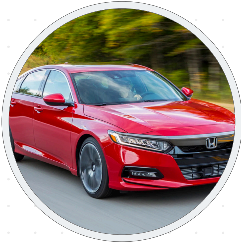
Honda Civic 2019